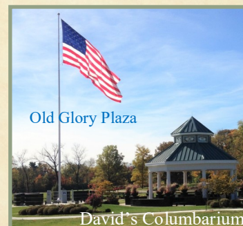
Old Glory Plaza