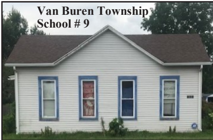
Van Buren Township School #9