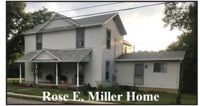
Rose E. Miller Home