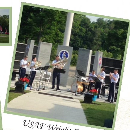
USAF Wright Brass