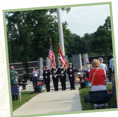
Kettering Fire Department